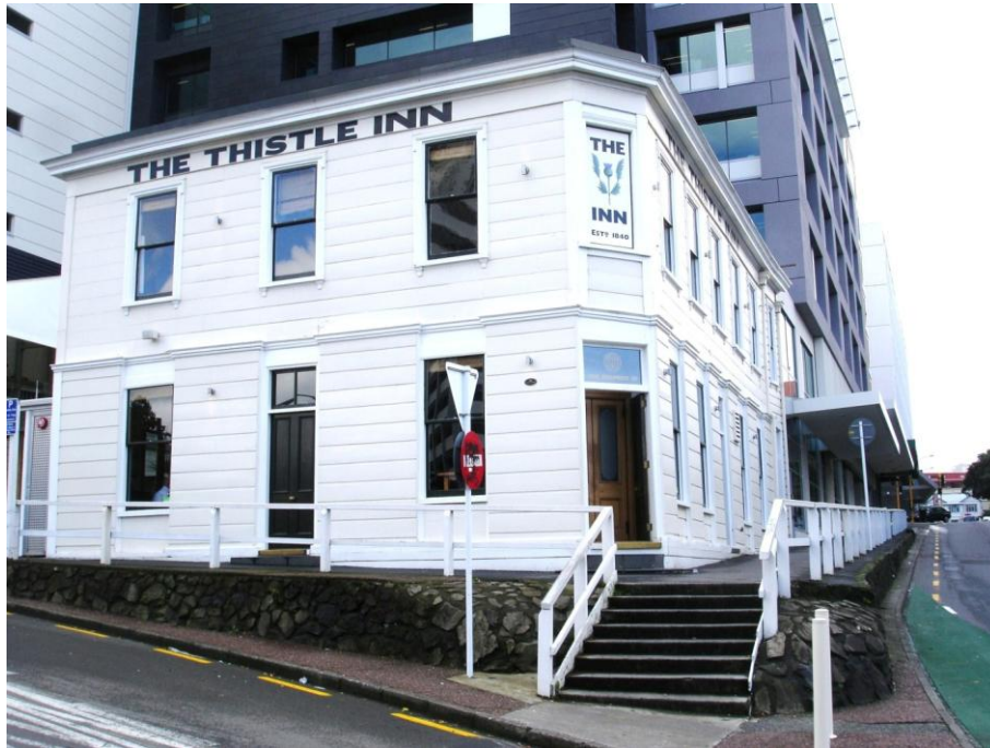
The Thistle Inn 2009