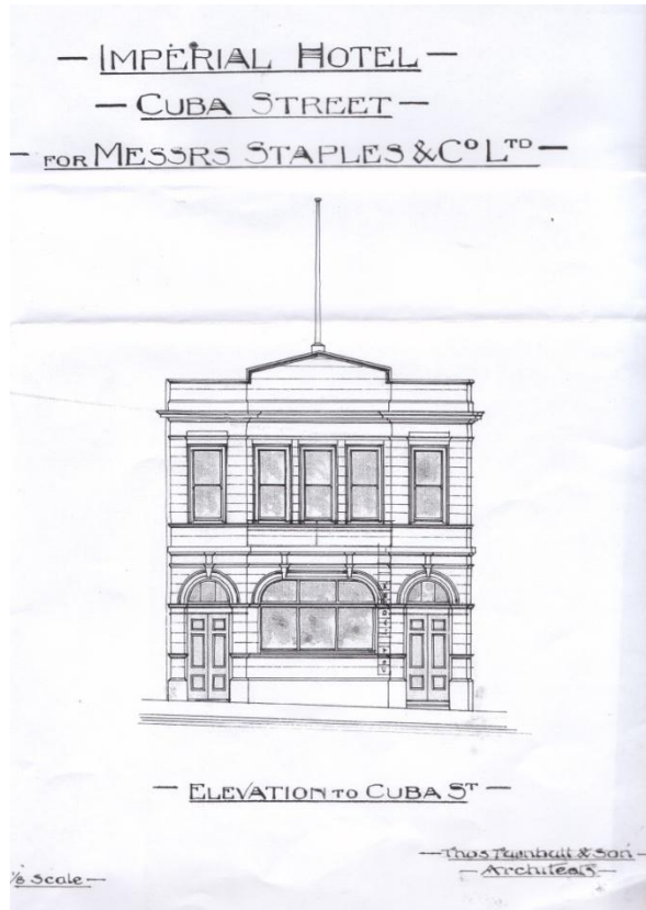
Elevation to Cuba St