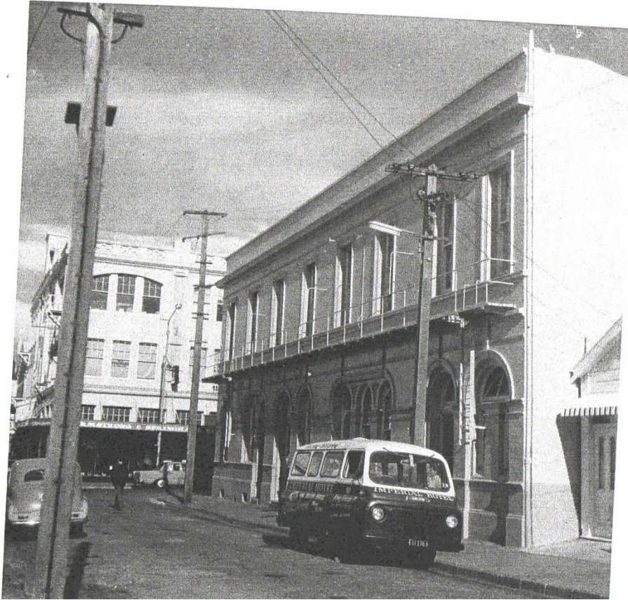
The Imperial Hotel 1975