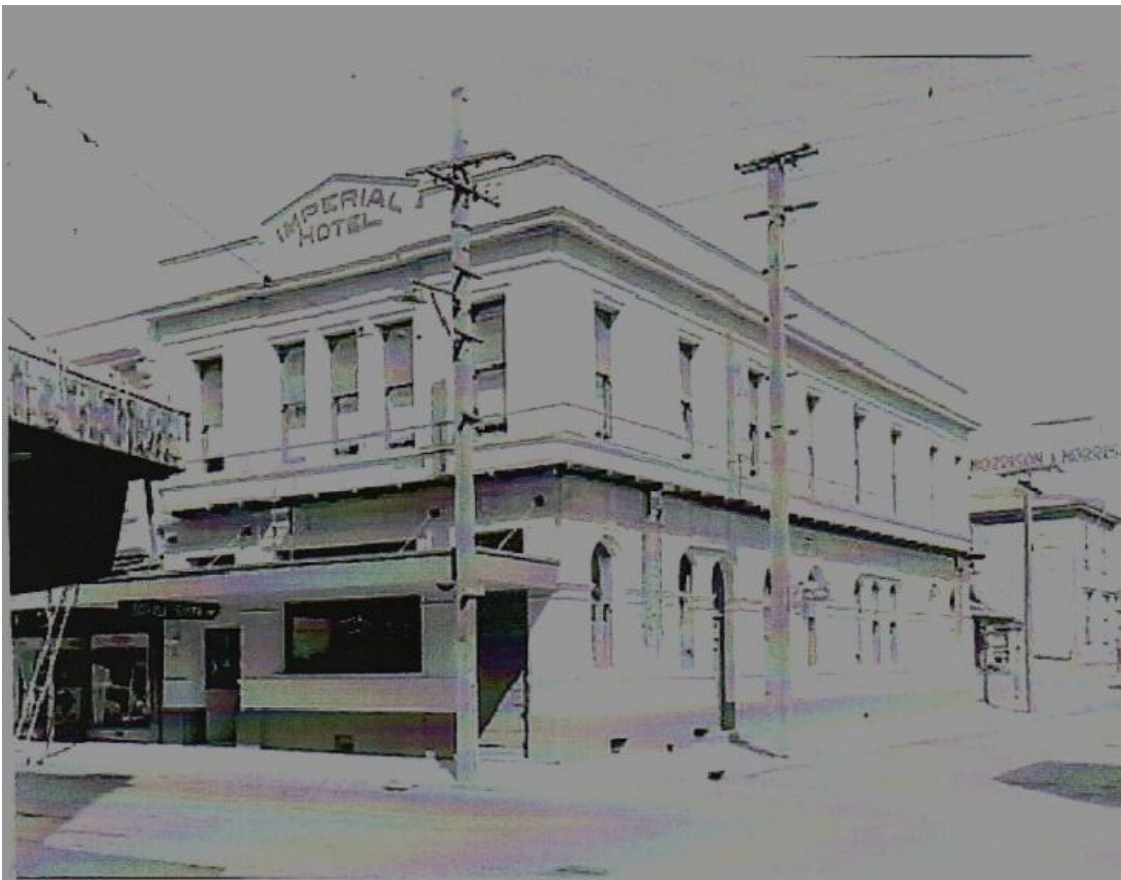
The Imperial Hotel 1965