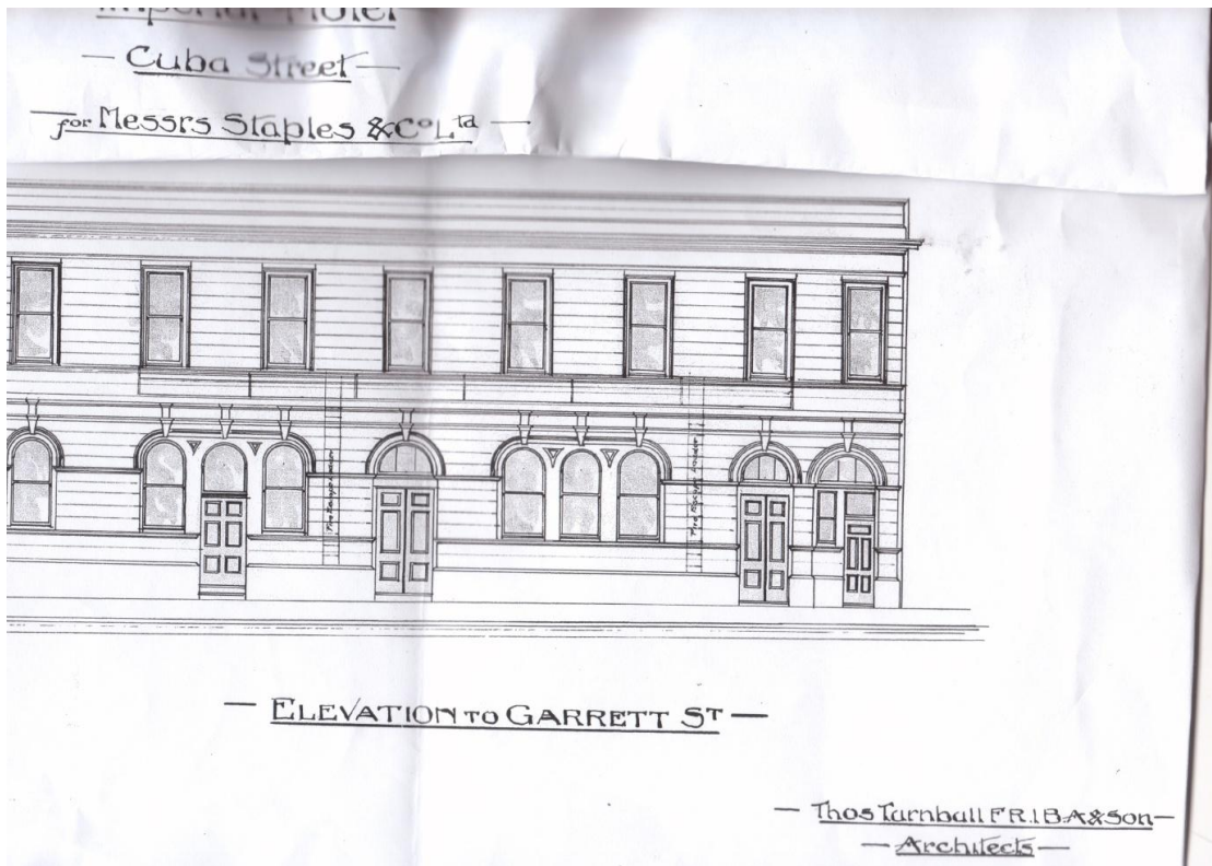
Elevation to Garrett St