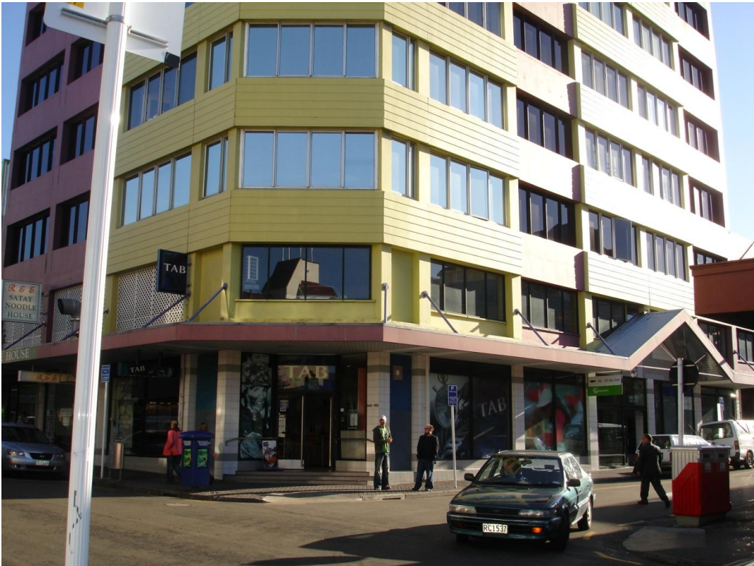
Cnr Cuba & Garrett Sts 2009