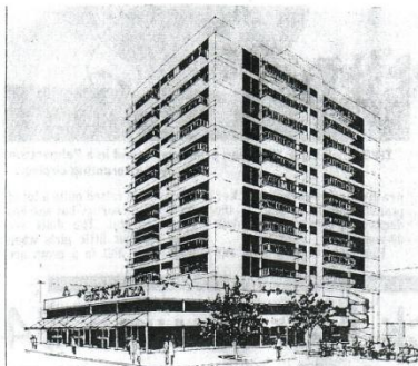
1983 REDEVELOPMENT PROPOSAL