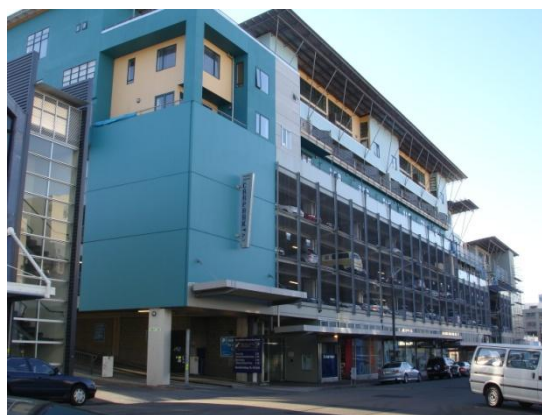
2007 Marion St Car Park & Apartments including 28 Marion St