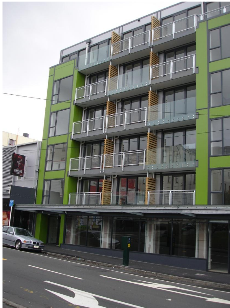
2009 Apartments 140 to 144 Vivian St