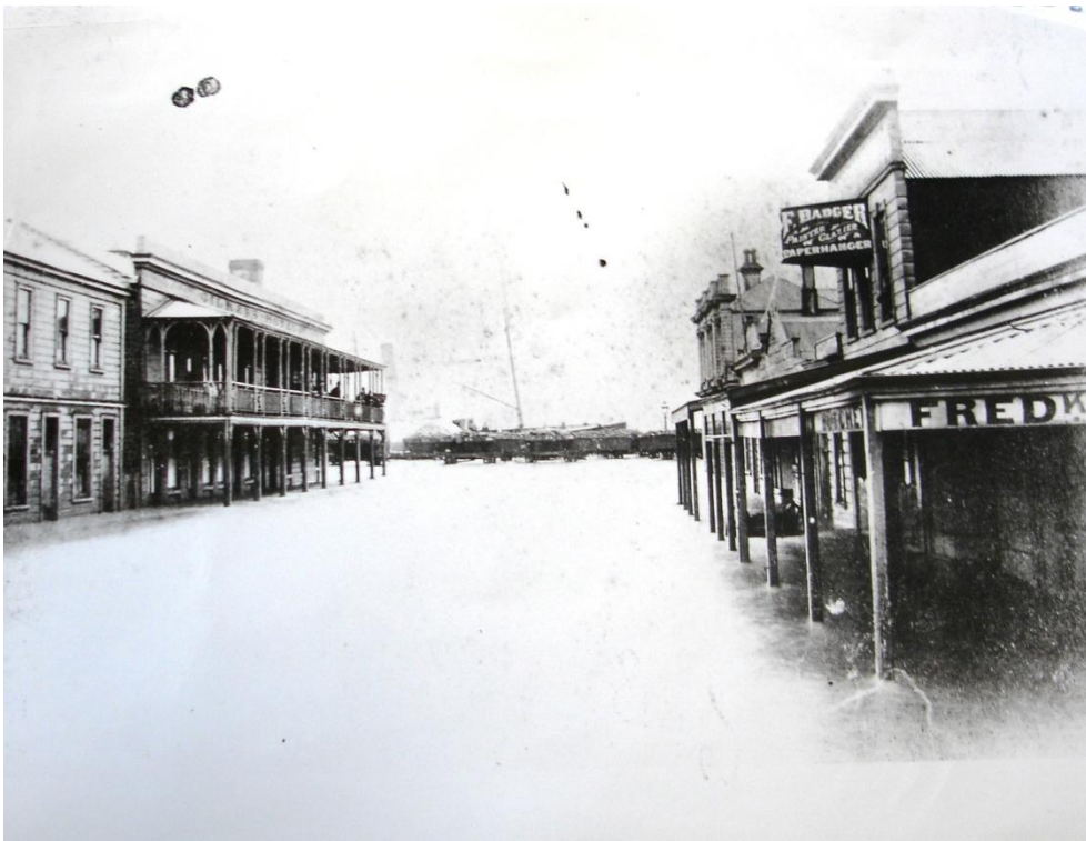
1887 Flood Gilmer Hotel on Left 7