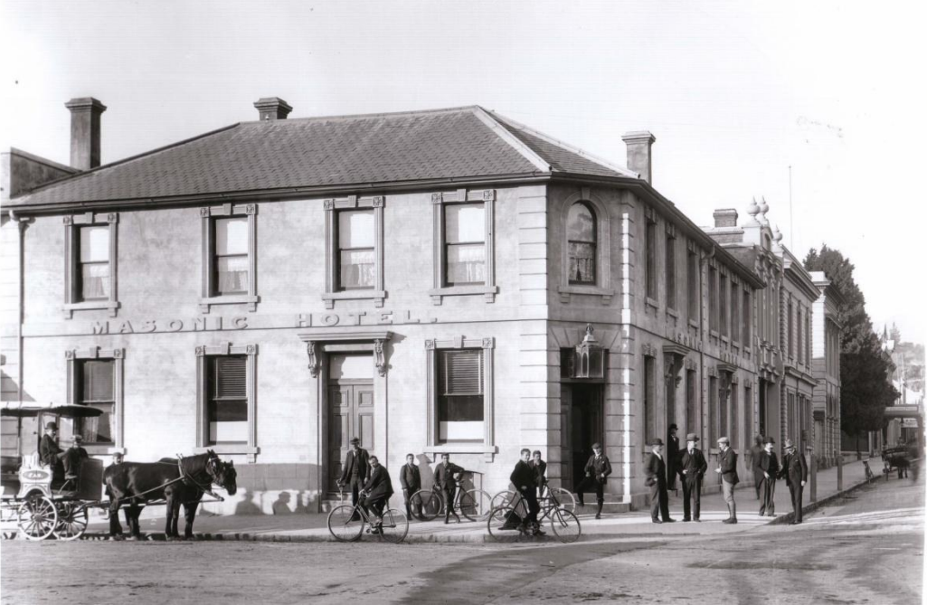
Masonic Hotel 1902