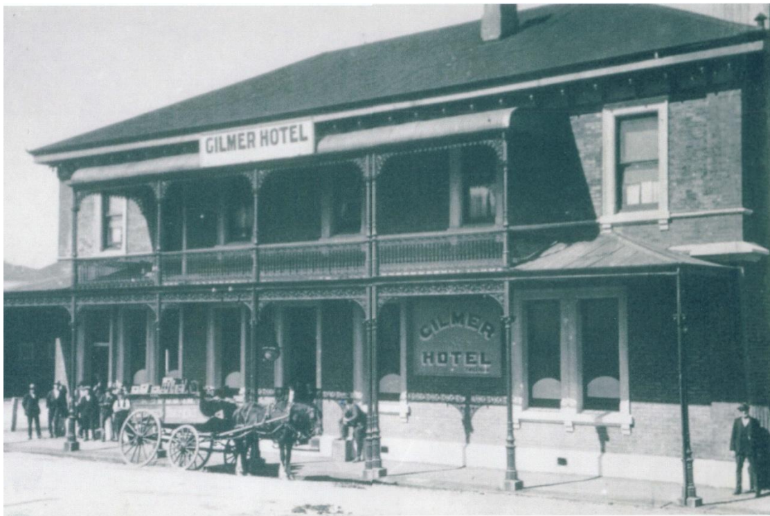
New Gilmer Hotel 1924

The Gilmer Hotel still exists in Greymouth today, well over hundred years later, at the same location offering backpacker accommodation under the name of Neptune Backpackers.