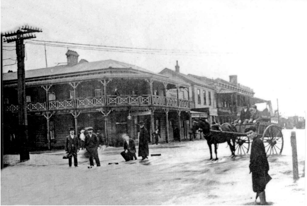
1905 Premier Flood Gilmer Hotel 8