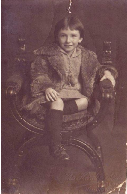
1924 Age 5