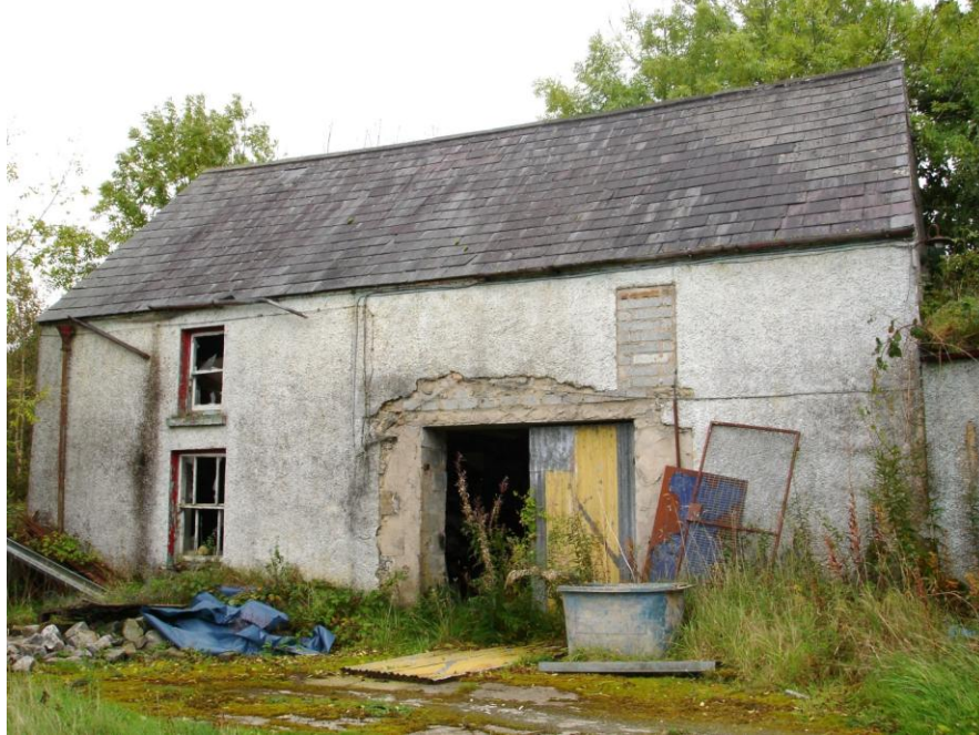
Gilmer Farm House Mullaghnee 2009