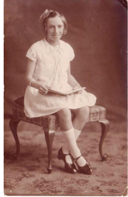
1931 Age 12