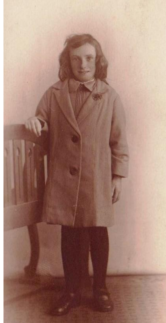
1927 Age 8